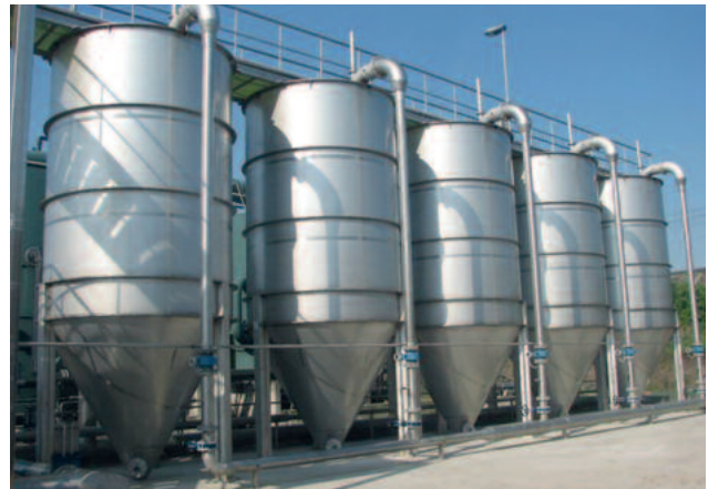
HUBER Sandfilter CONTIFLOW® 72, Montebello, Italy