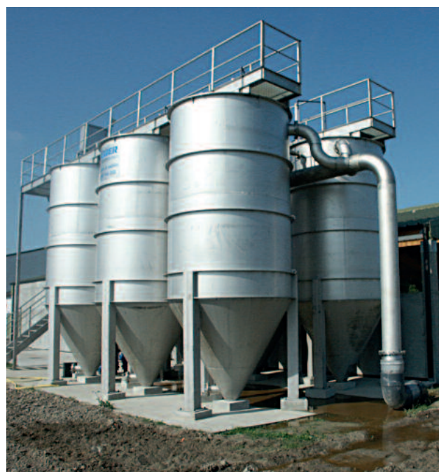
HUBER Sandfilter CONTIFLOW® 51, Montmartin, France

In case of increased disinfection requirements, installation of a subsequent disinfection system is possible due to the low concentration of solids in the filtrate.