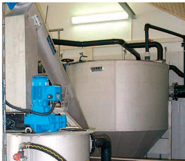
HUBER Circular Grit Trap HRSF with integrated classifying screw and subsequent HUBER Grit Washer RoSF4 T

The layout of the HUBER Circular Grit Trap HRSF was made on the basis of numeric design engineering and tested and verified under practical conditions in collaboration with the German test institute LGA.