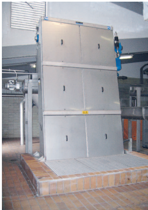
From the outside the HUBER Rake-Max®-hf is not distinguishable from a RakeMax® unit, the well-proven basic machine design.