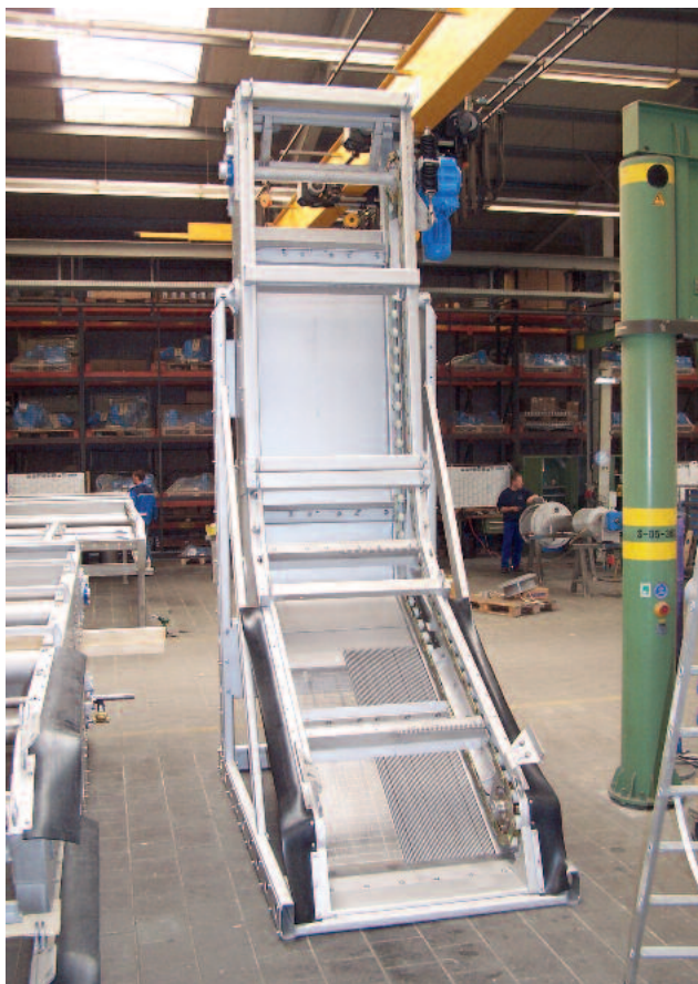
HUBER Rake-Max®-hf unit in our factory before delivery: The flat bottom section which provides favourable hydraulic conditions is clearly visible.