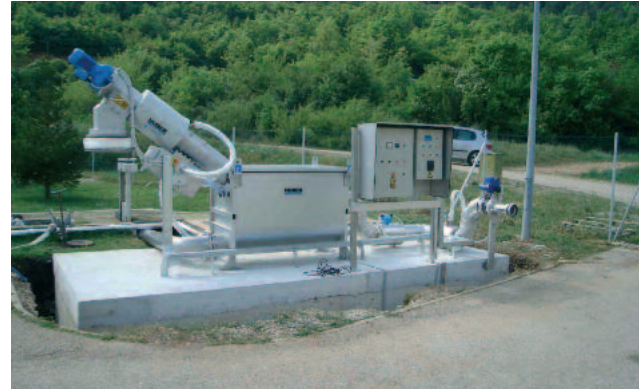
Well-proven mechanical pre-treatment components combined within the ROTAMAT® Sludge Acceptance Plant Ro 3.3

Due to integration of all components in a single tank it is a very compact plant and odour annoyance is prevented. Complete treatment of the septic sludge is performed within a single unit.