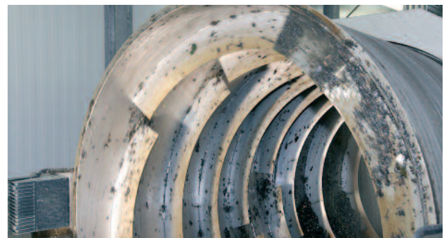
50 l screenings per rotation