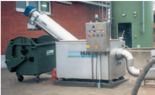
ROTAMAT® Sludge Acceptance Plant Ro 3.1 with ROTAMAT® Fine Screen, heated and insulated unit

The ROTAMAT® Fine Screen is extremely sturdy, able to deal with rocks and grit, and entirely made of stainless steel. It is fully self-cleansing as its rake tines fully engage the basket bars. (Please find more detailed information in our separate ROTAMAT® Fine Screen Ro 1 brochure.)