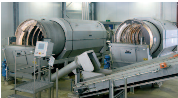
ROTAMAT® Sludge Acceptance Plant RoFAS