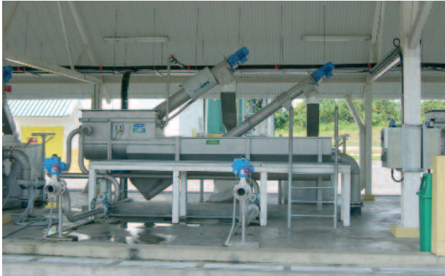
ROTAMAT® Sludge Acceptance Plant with un-aerated grit trap and integrated grit classifying screw

Due to integration of all components in a single tank it is a very compact plant and odour annoyance is prevented. Complete treatment of the septic sludge is performed within a single unit.