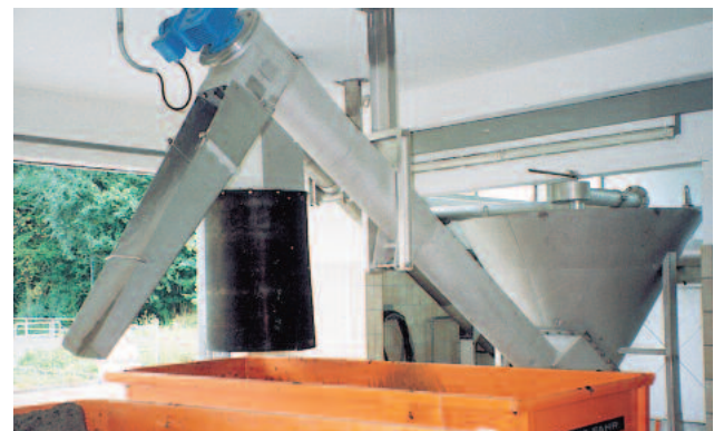
A classifying screw transports the grit from the separation room into a skip.