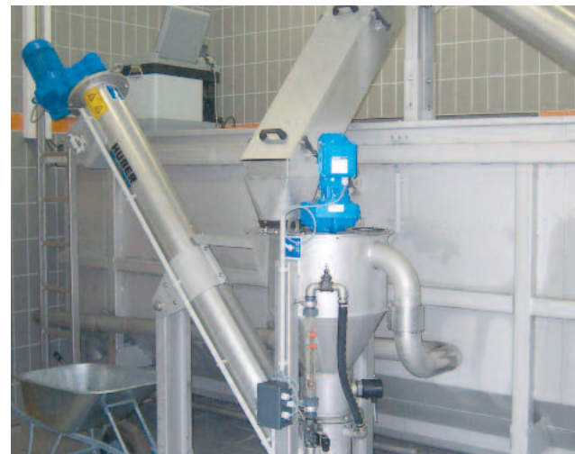
A small HUBER Grit Washer RoSF4 TC washing the classified grit from a HUBER Complete Plant ROTAMAT® Ro5