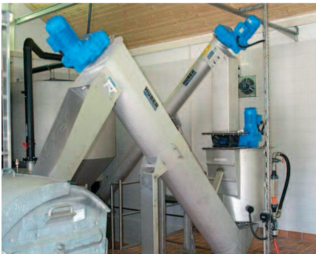
The HUBER Grit Washer RoSF4 T washes the classified grit from a HUBER Circular Grit Trap HRSF