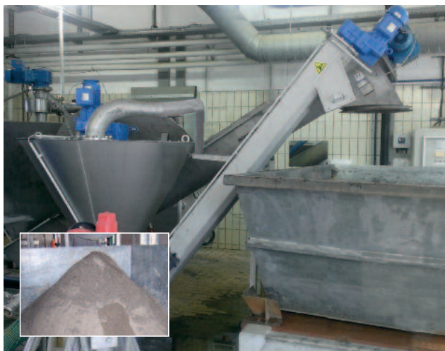
Grit washer installation on a municipal sewage treatment plant