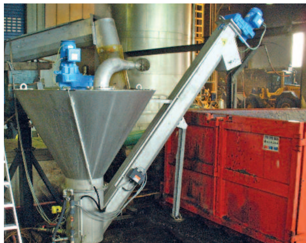
Special design for the treatment of sediments from biogas plants