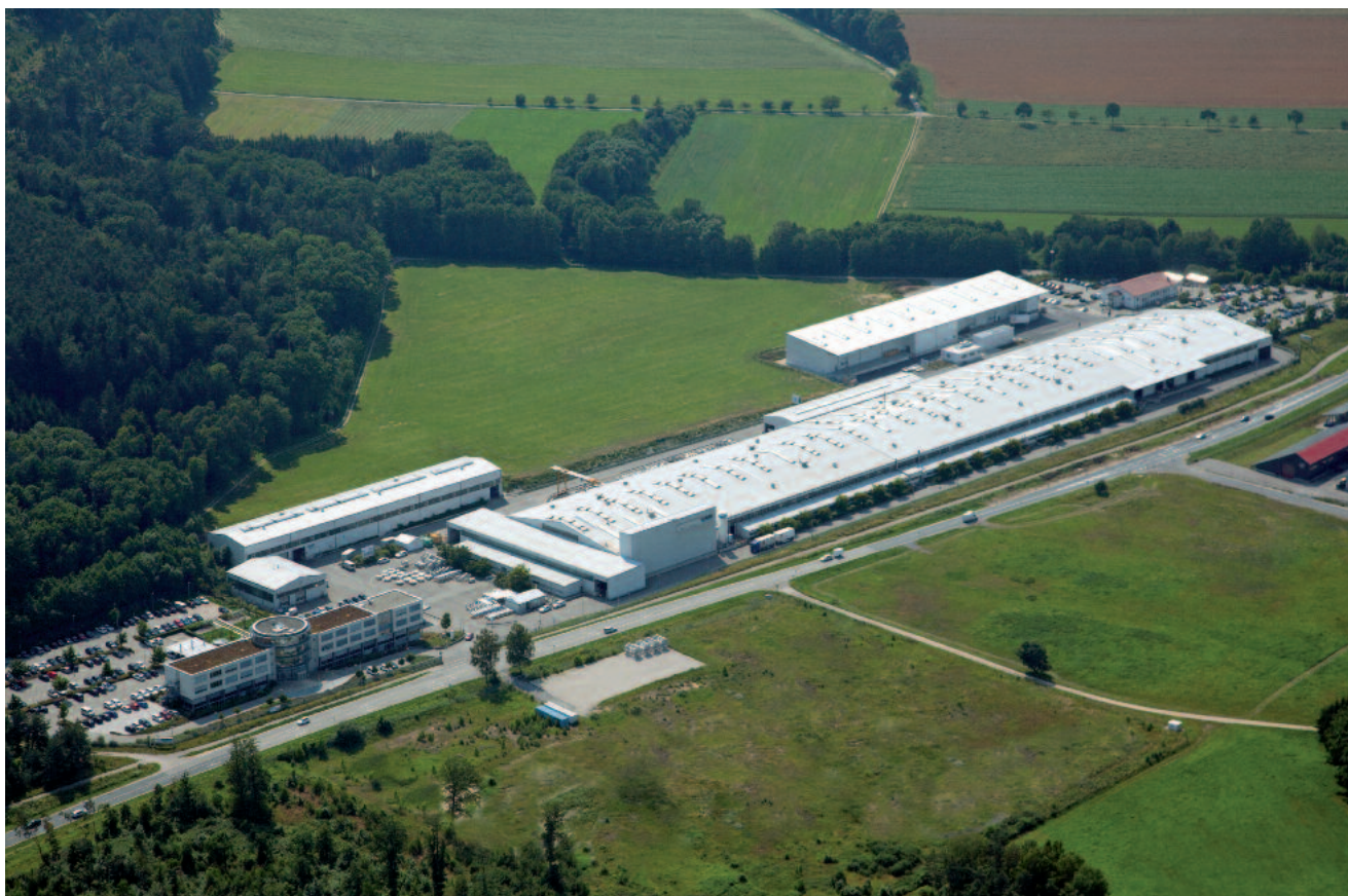
HUBER headquarters and production at Berching, Bavaria