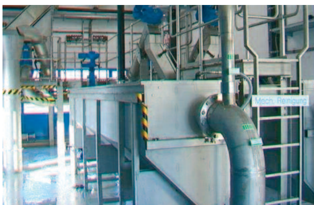
Above-ground redundant installation of a HUBER Longitudinal Grit Trap ROTAMAT® Ro6