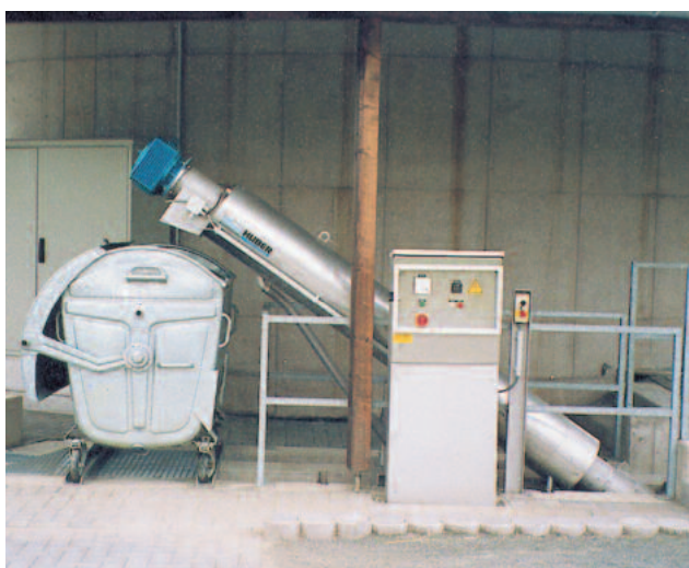
Outdoor installation of a HUBER Micro Strainer ROTAMAT® Ro9