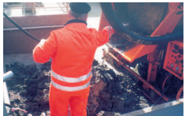
Tanker vehicle discharging onto the vibrating grate