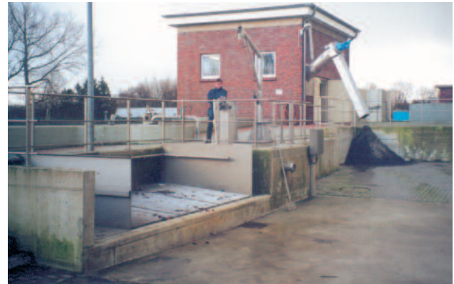
Long distances between the tank and Grit Washer are no problem.