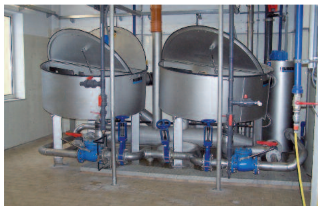
Two units installed in confined space