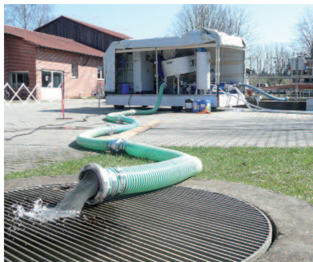
Mobile HUBER Disc Thickener S-DISC mounted on a car trailer, clear filtrate water runs off in the foreground