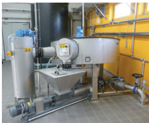
HUBER Disc Thickener S-DISC designed to thicken 35 m 3 /h