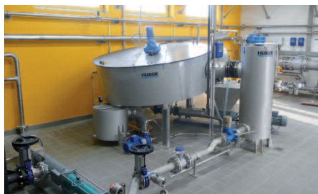
Filtrate storage tank and spray water pump for water recycling