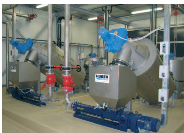
Two HUBER Rotary Screw Thickener S-DRUM units for 80 m 3 /h

More than 700 installations worldwide prove the reliability HUBER Rotary Screw Thickener S-DRUM.