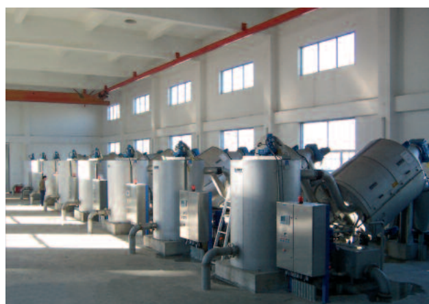
Eight screw thickeners handling 600 m 3 /h